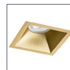
Gold reflector 4607047