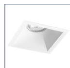
White reflector 4606859