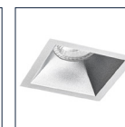
Silver reflector 4606873