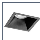
Black reflector 4606866